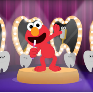
Brushy Brush Song Sesame Street