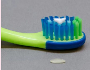
For children under 3, use a rice-sized amount of toothpaste.