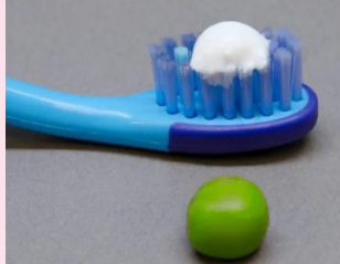
For children 3 and up, use a pea-sized amount of toothpaste.