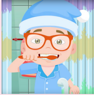
Tooth Brushing Song Blippi